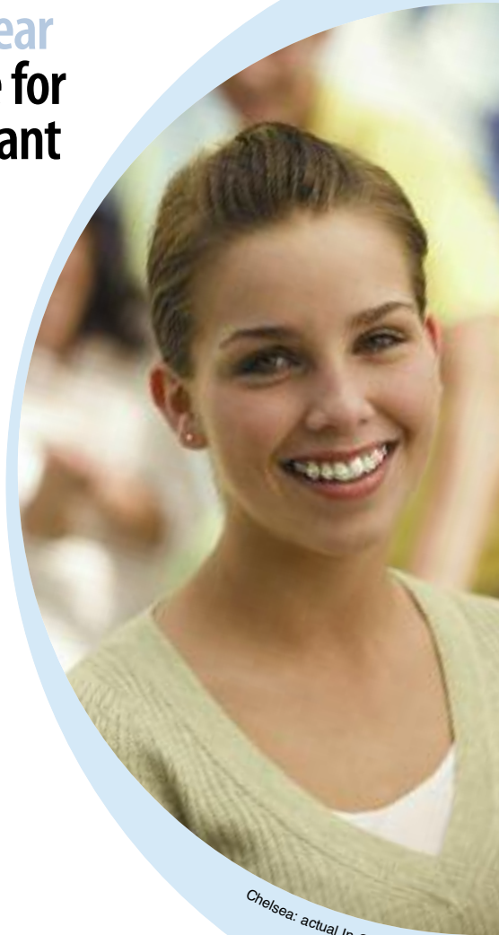
Chelsea: actual In-Ovation patient