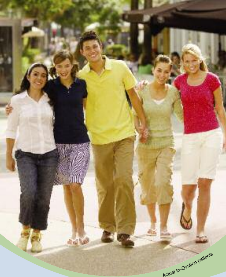
Actual In-Ovation patients