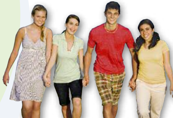
Actual In-Ovation patients

In-Ovation averages 40-percent fewer appointments than traditional brackets with ties.