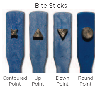
Bite Sticks Contoured Point Up Point Down Point Round Point