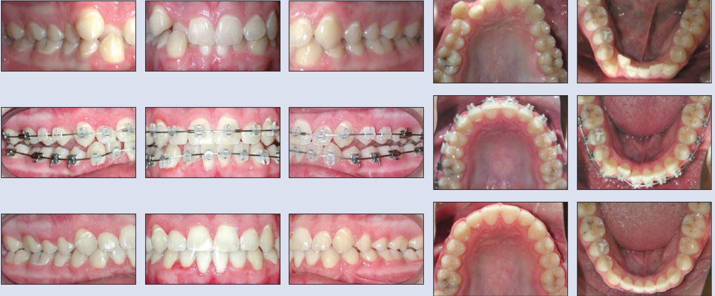
NON-EXTRACTION CASE WITH A TREATMENT TIME OF 13 MONTHS